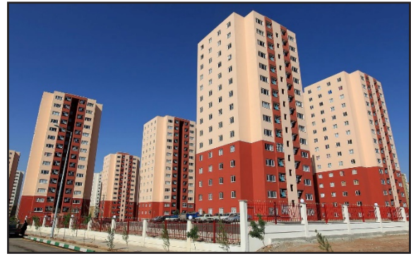
Fig. 3: Poor connection between inside and outside, Maskan Mehr project, Iran.

Third approach, creation of in-between spaces, can be a proper solution for achieving qualities of inside and outside at the same time and at a same place. Places for taking advantage of inside and outside, joy and mystery, surprise and diversity, prospect and refuge can add pleaser and quality to architectural space. This design approach can help to overcoming low-quality living spaces crisis in some architectural type that for many reasons has neglected proper connection between inside and outside. Most of residential buildings at Iranian big cities have this potential to be joined to this architectural type; focus on in-between spaces can be right solution to increase space quality and user's satisfaction.