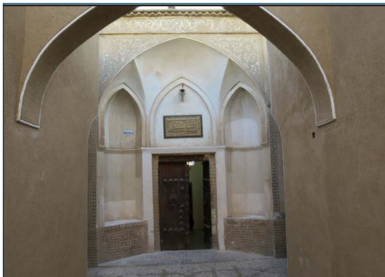
Fig. 1: In-between space: Hashti, Tabatabaei house, Kashan, Iran.

The Islamic traditional housing plans follow Islamic culture and beliefs on the separation and control of relationships between the family members and the outsiders, and women and foreigners. The door of the house in this place had retreat, and it created a place (transition space) for waiting until the door was opened, or for discussion. Usually, this place had two platforms for the elderly to sit on and rest. Also, people could stay in that place without inconvenience to other passengers in the alley or street (Asadi et al., 2015).