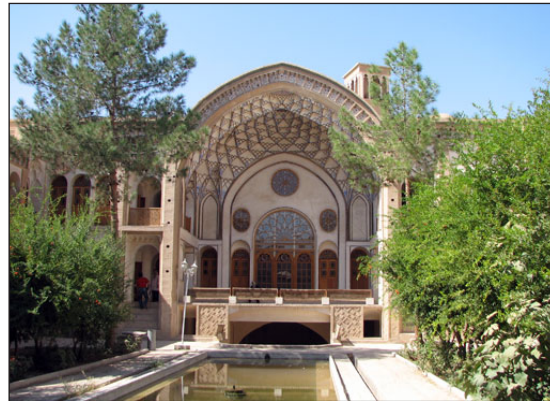
Fig. 2: In-between space: Ivan, Ameri house, Kashan, Iran.

closed front space with a height the same as that of roof. These spaces performed their unique feature along with open and close spaces to personify the building an independent identity (Soleymani et al., 2011).