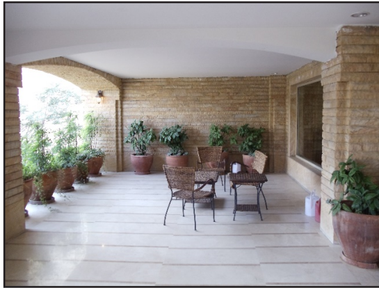
Fig. 7: Place to stay as an in-between space, Niavaran apartment, Tehran

shelter for providing physical and psychological comfort but outside environment has advantages that human' need to them is essential. In-between space is a design solution to human's demand to taking advantages of this coexist spatial realms simultaneously and at a same place, but this space is impacted by many factors and issues that consideration of all of them is important such as architectural functions, climate situations, cultural and life style issues, aesthetical concerns and so on. This spaces can act as places for pleasuring physical or visual access between inside and outside or can provide places for staying and take advantage from enjoyable aspects of outside environment such as pleasuring perspective, fresh air and so on, while being safe from its undesirable factors such as severe radiation, annoying temperature, intruder wind and so on. The physical form of the in-between space, their attachment and similarity to outside or inside and how it can establish interaction between spaces is dependent to factors that mentioned above and in addition to all of them it is an opportunity in architect's hands to form it creatively. Methods and design considerations of in-between design, especially in residential buildings in Iran's big cities, could be subject of further researches that may have some decent impacts in architectural space.