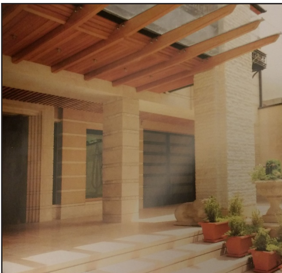
Fig. 6: Place to pass as an in-between space, Niavaran apartment, Tehran, by M.R.Nikbakht

Consequently purpose of creation an in-between space in simplest way can be building a penetration for allowing passage between inside and outside or it can be more and more by responding to all aspects that mentioned above; in spite all of this architecture is act of creativity and in-between space, in addition of responding to all of those demands, can go further and make a place for pleasure and surprise.