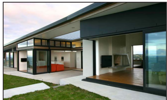
Fig. 4: Conflation of inside and outside by a faded line, residence in New Zealand, by Daniel Marshal.