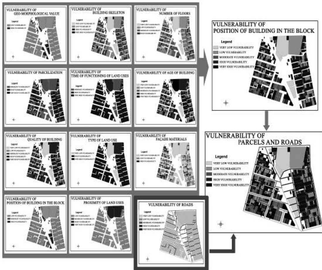
Fig. 2: Map of modeling stages of vulnerability of the area under study

To give a measure of vulnerability of the area under study (a part of municipality district 10 of Tehran), 11 factors have