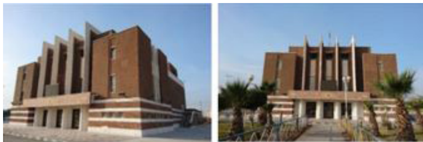
Fig. 3: A part of the Taj oil cinema in Abadan.

eye boredom. The Iranian and English oil companies signed a contract directly with the most famous film companies such as Metro-Goldwyn-Mayer, Columbia, Twentieth Century Fox,