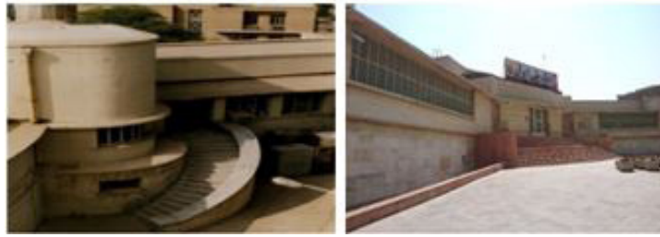
Fig. 4: National bank building facade of Abadan.

(Figure 3). National bank building, the first and old building was built in 1930 and the new one was built in 1970. Both of them have two floors and a barrel-vault. The national bank building of Abadan consists of two new and old modern concentrated cylinders with two diagonal cubic rectangles. The building has two entrances in the parallel street of municipality and Taleghani. In 1990, after the imposed war of Iran and Iraq, many reformations were done in the damaged parts. The facade of both buildings is made of stone and has no embellishments. There are some windows around the old building. The facade of the new building has many windows and vertical radiation at the top and some white shield between windows (Figure 4).