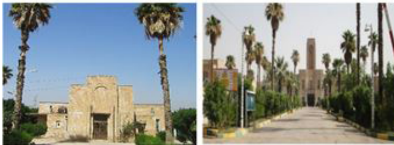
Fig. 2: A part of the building facade of the oil industry of Abadan.