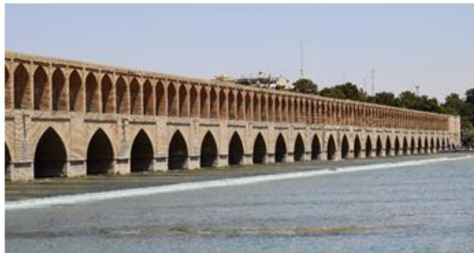
Fig.1: Allahverdi khan bridge