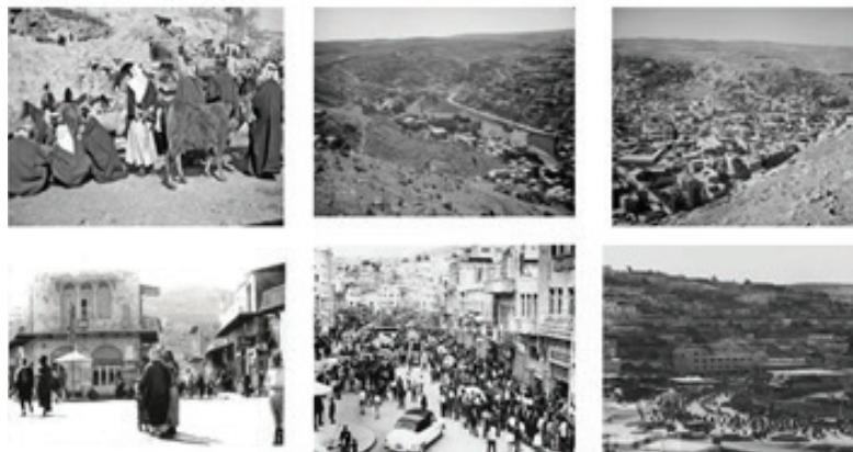
Fig. 3: Amman in (a) 1917, (b) 1927, (c) 1935, (d) 1947, (e) 1958 and (f) 1958 (Municipality of Greater Amman, 2019).

defining the shape of the city, its functions, different uses, transport lines, and other functional features in a general way. In 1964, the commune of the city began to develop alter detailed norms that subsequently contributed to the realization of the contents of the organizational charts of the territorial planning in collaboration with some experts. The unexpected increase in the population of the city, controlled by mass immigration by the population in the neighboring region of the emotive of wars, hindered the development of the old global regulatory plan of the city, despite the many tentative initiate the process of development of the global regulatory plan. It has always been hindered by the same problems of overcrowding of the population, and the presence of areas abusive difficult to control and the uncontrolled construction of government agencies especially in the abusive areas (Ababsa, 2011; Abu Al-Haija & Potter, 2013; Abu Odeh, 1999).