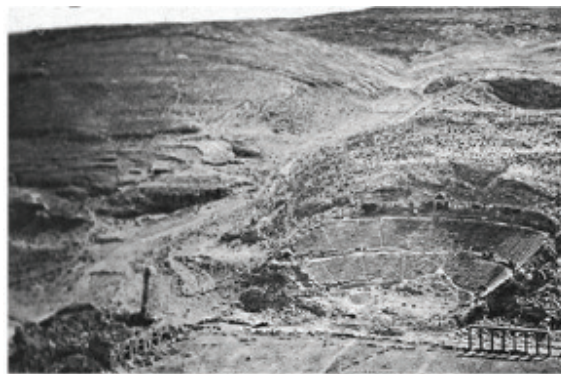
Fig. 2: Amman in 1892 showing the Roman amphitheater (Municipality of Greater Amman, 2019).