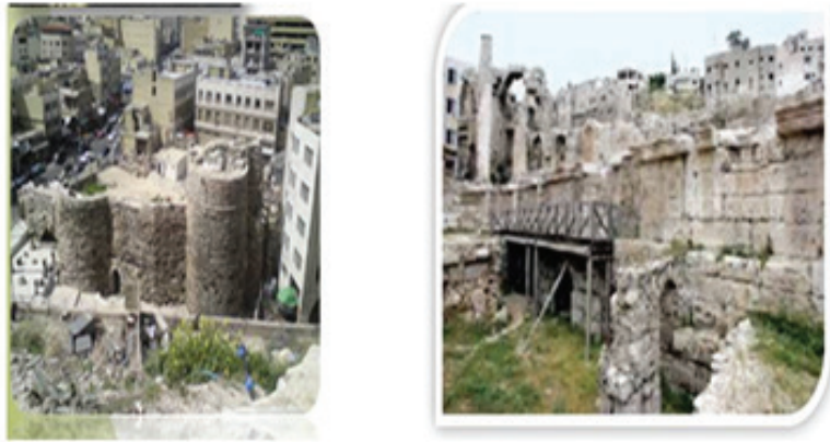
Fig. 5: the Way of Nymphaeum, Downtown, Amman.

and Levant). The Al-Husseini Mosque is 58.5 m long and 12.5 m wide. It has a front hall and two side galleries. In the middle is a heavenly square, two minarets that rise right 70 m and the left 35 m. the grand Mosque of Husseini is considered the first urban project to build in Amman. The building started in 1924 and was completed in 1927.