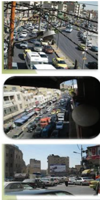
Fig.7: Traffic congestion of overlapping pedestrian movements with cars.

The historical Amman Downtown can be a worldwide attraction center if conserved. The accessibility to the Downtown of Amman and the movement within the center is very difficult due to the lack of public attitudes and the strong presence of high level visual, audio and environmental pollution such as the acoustic approach. The lack of separate movements of pedestrian and automobiles creates strong interference of traffic movements especially in the center of the Downtown streets. In addition to the invasion of sidewalks by illegal street vendors and lack of indecent signs, marks the major problem to be put forward for critical solution (Abu Odeh, 1999; Municipality of Greater Amman, 2019; Robert & Marpillero-Colomina, 2011).