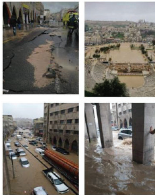
Fig. 4: Water flooding in the Downtown, February 2019

The Downtown hosts lots of landmarks of the country. For instance, Al-Husseini Mosque which is the oldest mosque in the Jordanian capital was founded by Prince Abdullah Bin Al Hussein in 1923. It was named after Sharif Hussein Bin Ali (The commander of the Great Arab Revolt in the Arabian Peninsula