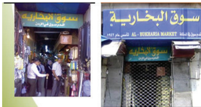
Fig. 6: Bukharia a Market, costume jewelry.

The oldest market in the Downtown and probably in Jordan was established in the year 1942. The first mission of Sheikh Kamal Al-Din Al-Bukharia after arriving from Medina was to establish the old Bukharia market in the eastern square of the Husseini Mosque in 1943. The market remained in its position until a fire broke out in the area and it was reconstructed in a nearby area along King Talal Street opposite to Husseini Mosque (Fig 6).